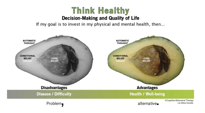
Fig. 1 Coping card: "Think healthy and feel the difference". According to cognitive-behavioral therapy, the following three levels of thinking occur: (1) automatic thinking (i.e., the avocado peel), which is not related to reflection or deliberation; (2) conditional beliefs (i.e., the flesh), which is the level of cognition associated with behavior; and (3) core beliefs (seed), in which absolute or rigid thoughts are present. The figures of the gray and green avocados provide an analogy that differentiates unhealthy from healthy patterns. This technique aims to develop healthy behaviors by restructuring unhealthy thoughts into healthy thoughts, thereby balancing the patient's emotions and improving his or her quality of life

Patients were selected by convenience based on their availability to participate in this study and after describing in detail all of the intervention steps. The research